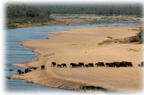
A greater kudu cow feeds on a long-tailed cassia seed pod, and a herd of elephants cross a sand flat on the Olifants River