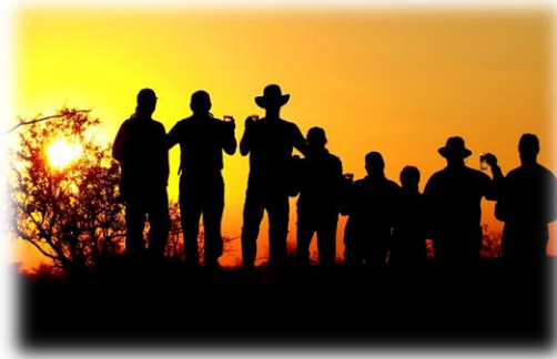
A group of buffaloes relax together in the Manyeleti, and our guests enjoy a safari sundowner in the west of the Manyeleti reserve near our camp

A typical day in Manyeleti consists of an early morning awakening to a light breakfast of fruit, yogurt and granola, tea, coffee and hot chocolate. With the sun rising, we will depart on a 3-4 hour game drive, touring this flatter, wetter, and thus often greener area of the Kruger Park's private game areas. Mid-morning there is a stop for coffee, tea, and cookies, depending on the activity level of the animals (a great sighting might warrant skipping a coffee!) After our morning game drive we will return to camp for a big breakfast, and are free until 2 pm when lunch is served. During that time you can relax, take some personal time, visit the wildlife blind over the watering hole, or watch an elephant drink from the swimming pool. After lunch we will again depart on a 3-4 hour game drive to view wildlife, returning after sunset whilst spotlighting for nocturnal creatures, before we return to camp for a well catered dinner.