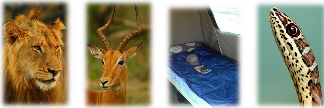
A lion, an impala, a berth in one of our tents and a western stripe-bellied sandsnake