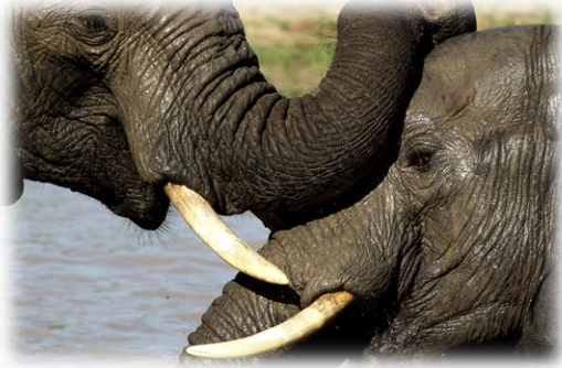
Zebras stand and pose whilst two elephants play in the water