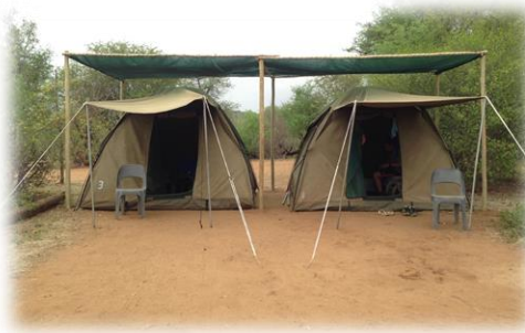
A black-backed jackal nervously surveys the bush, and two of our tents at Ngala Camp in Balule, in the Greater Kruger National Park